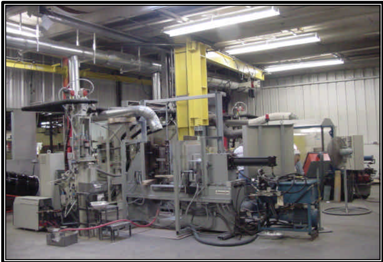
Powercon's Facilities for Cycloalaphatic Manufacturing

They do not form free carbons when exposed to high temperatures or electrical discharges but produce only gaseous by-products making them ideal as an insulating medium. The ability to mold the material into shapes not possible with porcelain makes it invaluable to designers. For over 30 years this insulation has established its exemplary electrical and mechanical characteristics in the merciless environment of outdoor usage. Some of their superior qualities are listed on Page 3.